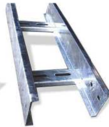
Ladder Type Cable Tray