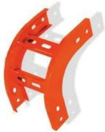
Vertical Outer Bend

We offer high strength ladder type cable trays that are perfect for heavy-duty power distribution in industries. Our ladder cable trays are available in the following specifications.