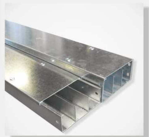
3 Compartment Race Way