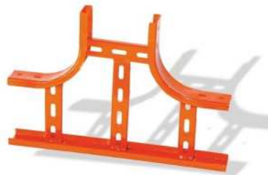
Ladder Type Tee